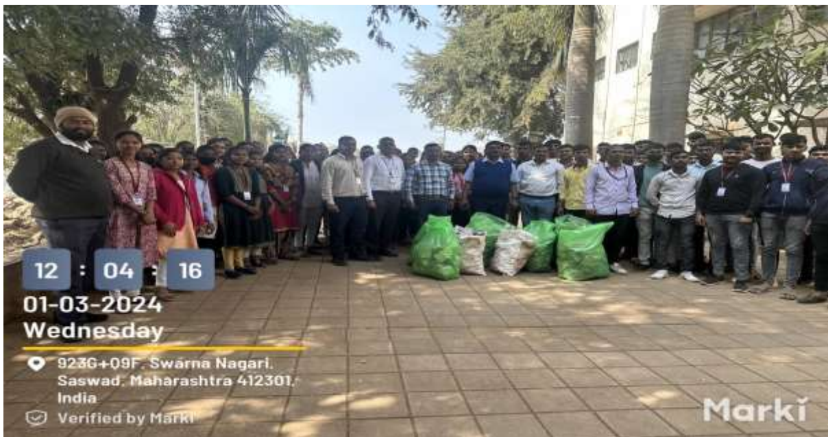
Collection of Plastics from the campus

PDEA's, Waghire College's Clean Campus Initiatives are a cornerstone of its commitment to sustainability and environmental stewardship. The college has implemented several measures to ensure a tidy and environmentally responsible campus. These include regular cleanliness drives, stringent waste segregation policies, and the installation of numerous recycling bins across the campus. The institution also emphasizes the reduction of plastic use, encouraging students and staff to adopt reusable materials. Educational campaigns about the importance of maintaining a clean environment are frequently conducted, involving students in activities that promote tidiness and environmental awareness. Through these initiatives, PDEA College aims to create a clean, green, and sustainable educational environment that not only enhances the campus aesthetic but also fosters a culture of cleanliness and ecological mindfulness among its community.