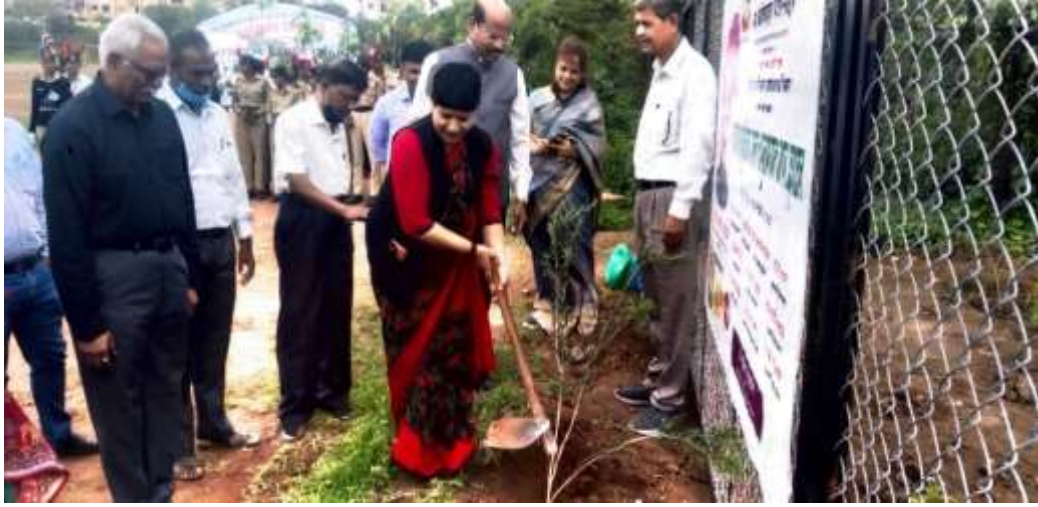
Tree Plantation Program by staff at college on 22/07/2022