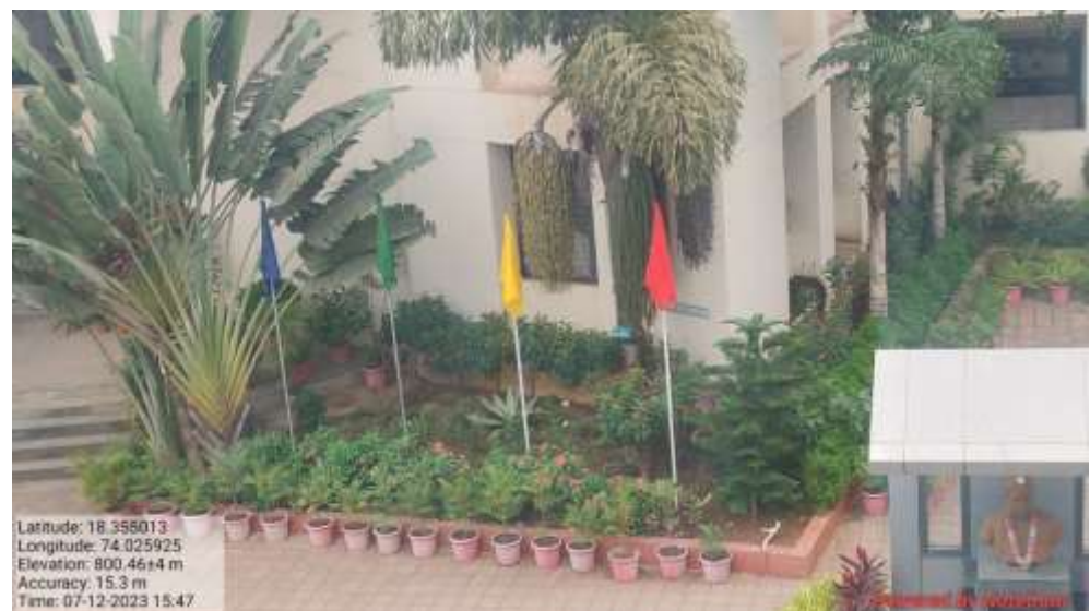
Green campus initiatives