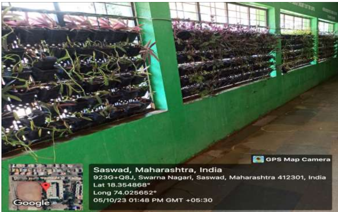
Green wall in College Building

The college campus is full of greenery. There is a plantation of local flora along with some ornamental plants. Also, there is a green wall developed by students.