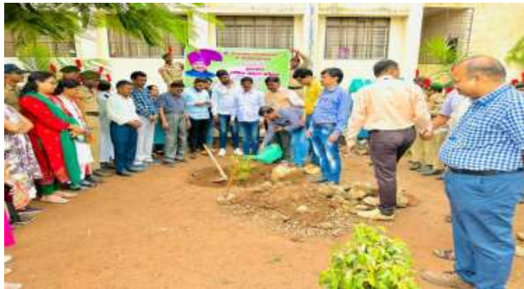
Tree Plantation Program by staff at college on 22/07/2023