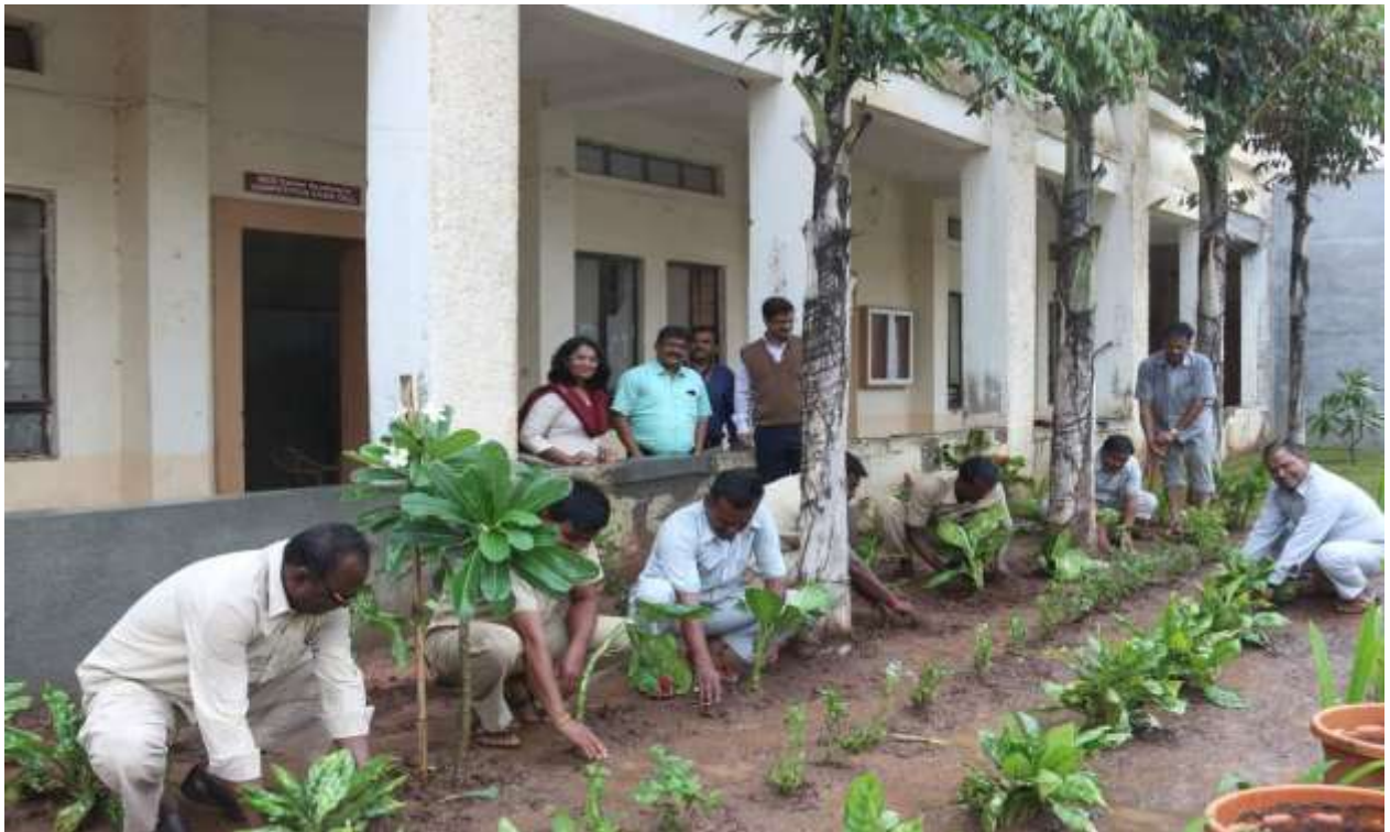
Green campus initiatives