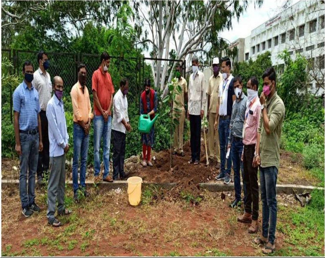
Tree Plantation Program by staff at college on 20/07/2021